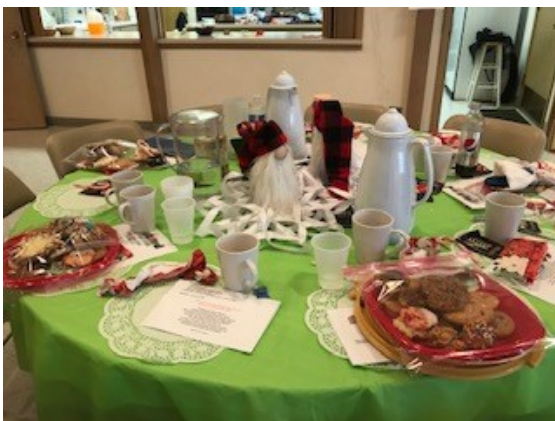
Presbyterian Women's annual Christmas Brunch & Cookie Swap

Performed by members of the congregation