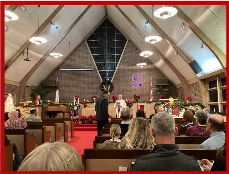
Folks enjoying our annual Christmas Eve Service December 24, 2023 Thank you Lord, for such a wonderful attendance!